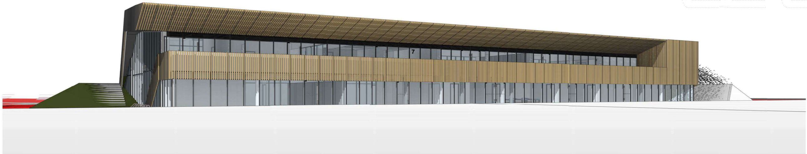
2. View from East